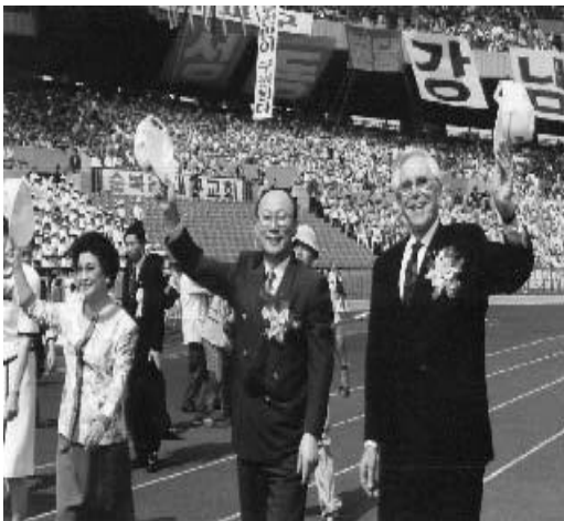
Crusade at Olympic Stadium in Seoul with Robert Schuller.

While these grand, international Christian events were being held in Seoul, our church stepped up to meet the demands and challenges for hosting and supporting those events. We offered our church as the venue for these functions and served as a wonderful working model of the manifestation of revivals breaking out in South Korean churches, being located near the renowned Yoido Plaza