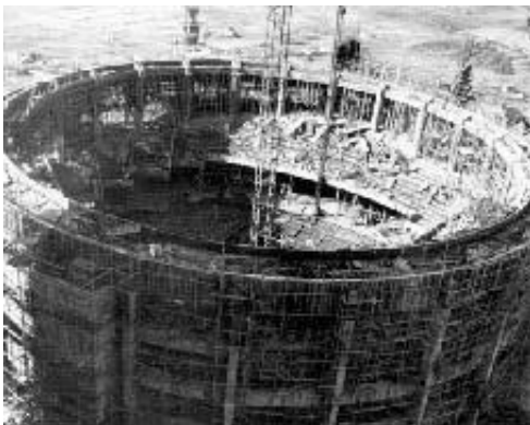
The Yoido church sanctuary under construction.

was filled with fear. I saw the ghost town-like building site and my heart felt heavy. "What do I do now?" I said to myself. Then gradually the way I was feeling began to change. I felt God consoling me, and my heart filled with the dream again. So I decided to reassess the situation through the eyes of faith. The dream of seeing 10,000 of God's chosen people, worshipping together in a new sanctuary, began to move and grow again and the rain and the snow watered it. Then, one day, God spoke to me and said, "Offer me what you own."