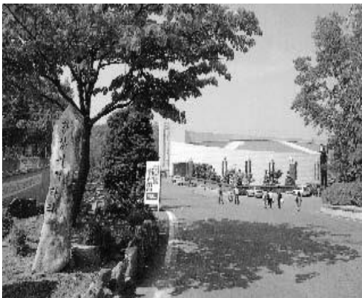
Osanri Fasting Prayer Mountain.