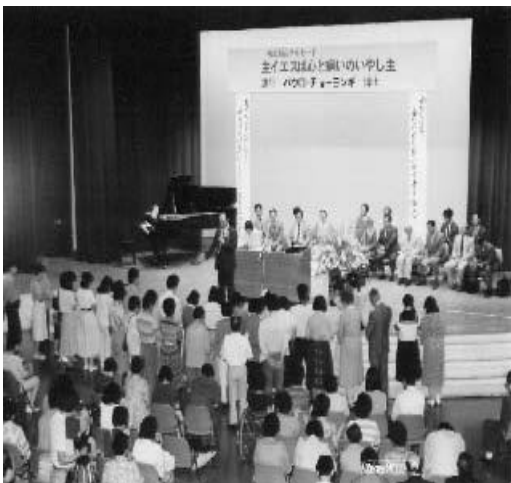
Altar Call at a crusade in Yokohama, Japan.

Crowds gathering for a crusade of Dr. Cho.