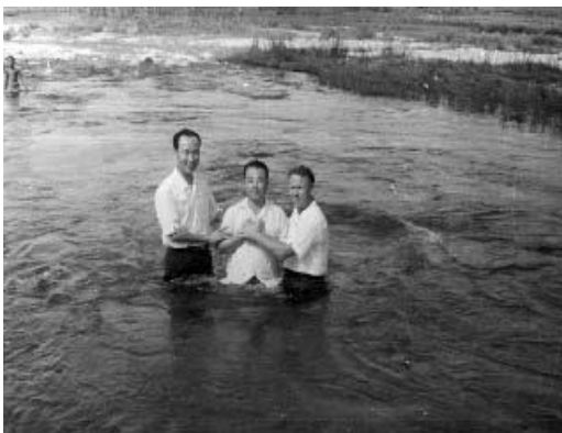
Baptism service in the river near the tent church in Daejodong.

worry about it since after the submersion they could quickly change into their dry clothes and warm up next to a bonfire. But missionary Hurston and I had to remain in the water, chest high, for nearly two hours.