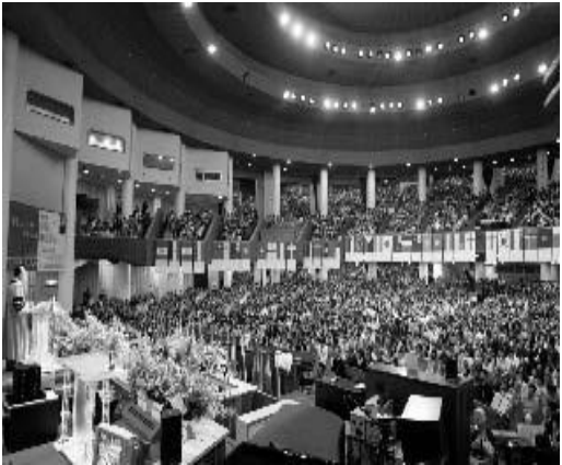
One of the Sunday morning services.

Yoido Full Gospel Church — the largest church congregation in the world.