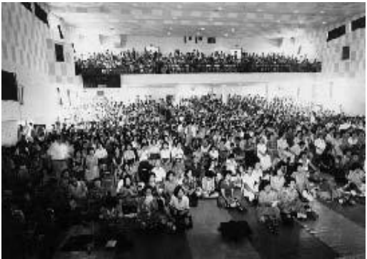
A service at Seodaemun Church.

The moment we had been waiting for finally arrived: the completion of the Revival Center, which could seat 1,500 people. We held the Inauguration Service on February 18, 1962.