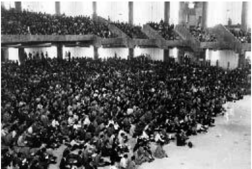
Services held in the unfinished sanctuary.

a businessman sent by my God, the King. I know that in the business world credibility is everything. You are a businessman, too; and you lend people money. I would like you to lend me the money. I'm in no position to file any papers, so you will just have to place your trust in me and lend me the money."