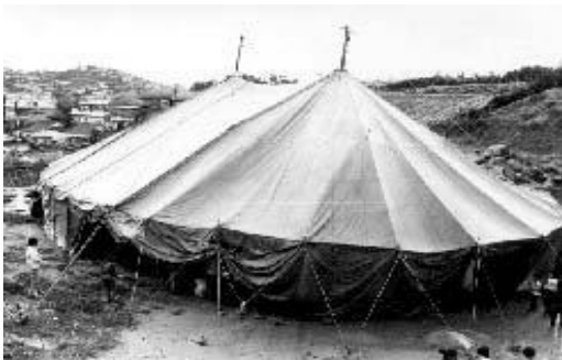
The tent church in Daejodong.

to people, beating on a drum to attract crowds. It was a difficult and hard time for everyone, but they were filled with peace and joy. Soon the congregation grew and multiplied by the work of the Holy Spirit, and we saw a need for a bigger church.